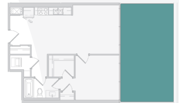
TERRACE LEVEL 5 32.3 sm / 348 sf