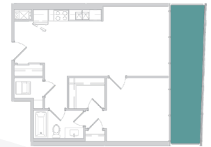
BALCONY LEVELS 6-19 13.5 sm / 145 sf