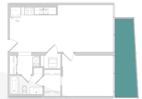
BALCONY LEVELS 6-18 11.1 sm / 119 sf