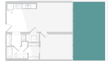
TERRACE LEVEL 5 32.3 sm / 348 sf